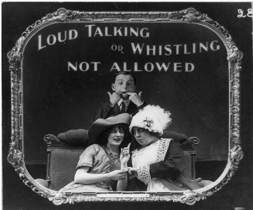
1 Loud talking or whistling not allowed.

The guild has committed to meeting via zoom until at least March 2022. The zoom link is sent out the week of the guild meeting. Need help with zoom? Checkout the videos the Royal City Quilters Guild have on their website: https://royalcityquiltersguild.ca/zoom-how-to/