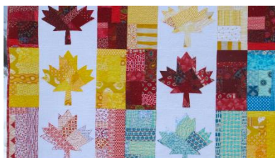
Maple Leaf Quilt