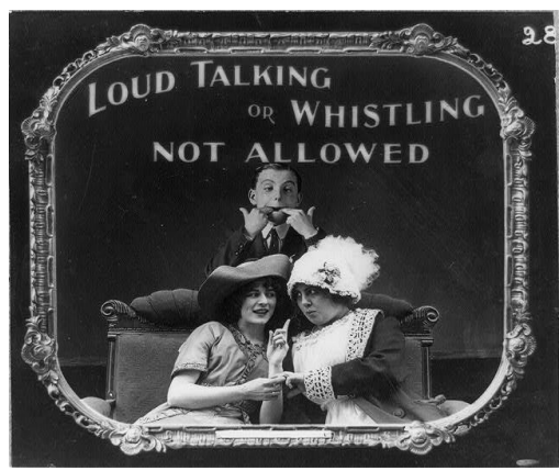
1Loud talking or whistling not allowed. Photo, copyrighted by Scott and Van Altena, 1912. //hdl.loc.gov/loc.pnp/cph.3a13960

Please remember to mute during the zoom meetings if you are not speaking. A red line through your microphone indicates you are muted. The microphone symbol may be in the top right or bottom left of your screen depending on the device you use.