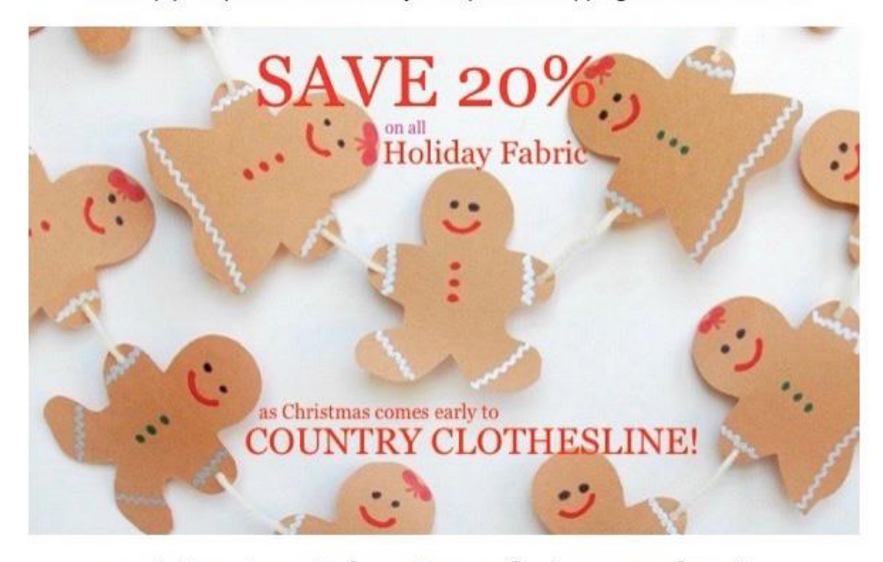
or visit us at 471 Cosburn Avenue for in person shopping Tues 10-4 Wed 10-6 Thurs 10-4 Fri 10-4 Sat 10-4 *sale ends October 11th*

for shop pickup, free local delivery or expedited shipping with Canada Post