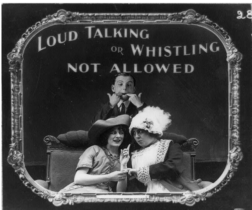
1 Loud talking or whistling not allowed.

The guild has committed to meeting via zoom until at least March 2022. The zoom link is sent out the week of the guild meeting. Need help with zoom? Checkout the videos the Royal City Quilters Guild have on their website: https://royalcityquiltersguild.ca/zoom-how-to/